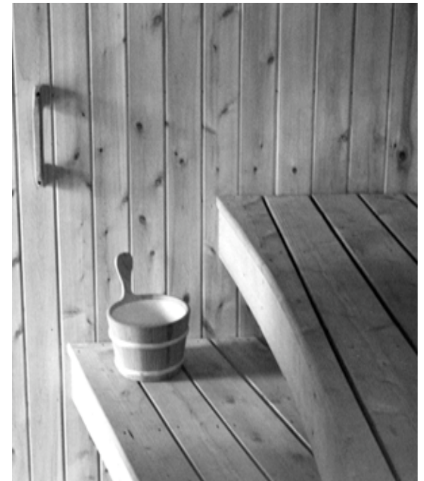
the sauna benches

I also custom make and sell Lämpimämpi Sauna Stoves for people who want to build their own saunas or replace an existing stove.